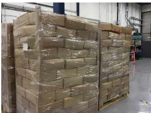
Pallets being stacked ready for despatch to Ukraine