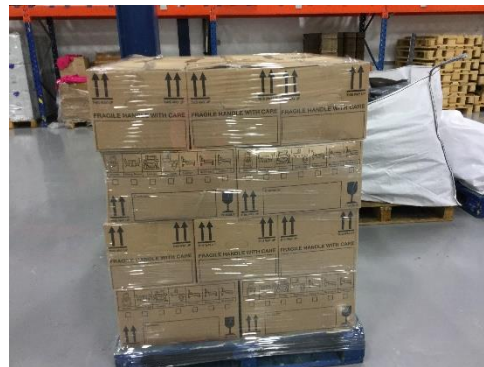
Single pallet of Boxes