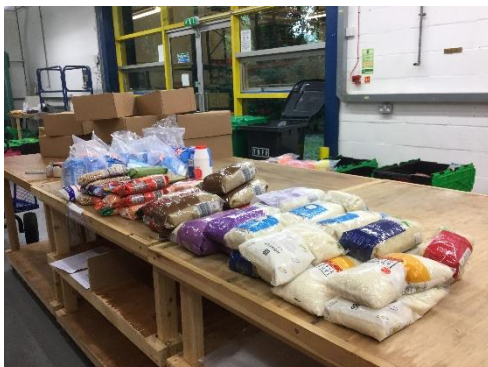
FCW Dry food giving